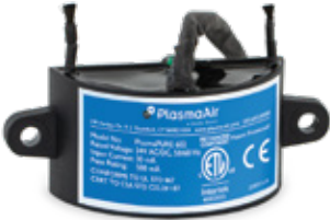
PlasmaPURE 600 Series

The Plasma Air HVAC products fit seamlessly into a home’s existing or new HVAC system for continuous whole-home air purification. From small to large residences, there is a solution to fit your needs. The Plasma Air 600 Series provides safe and continuous air purification to the entire indoor environment using patented brush-style bipolar ionization technology. The units are inconspicuous and require little maintenance. “The cost effectiveness was the key to putting one in every home,”